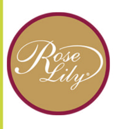
WHERE PASSION COMES TO BLOOM.