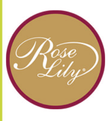
WHERE PASSION COMES TO BLOOM.