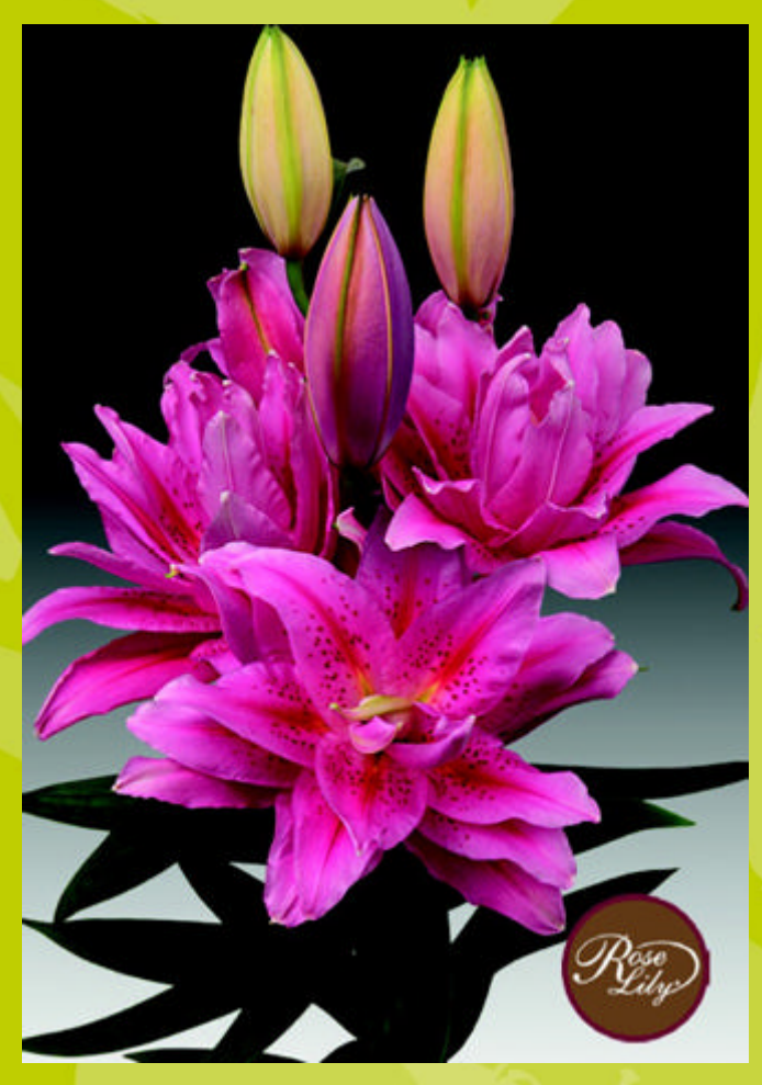
Rose Lily Viola