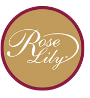
WHERE PASSION COMES TO BLOOM.