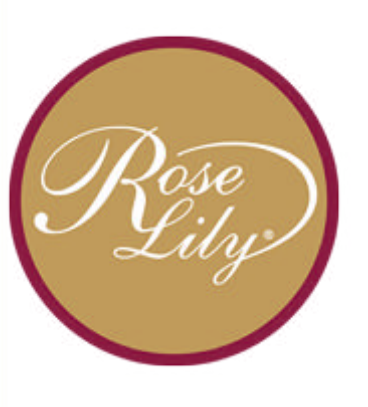
WHERE PASSION COMES TO BLOOM.