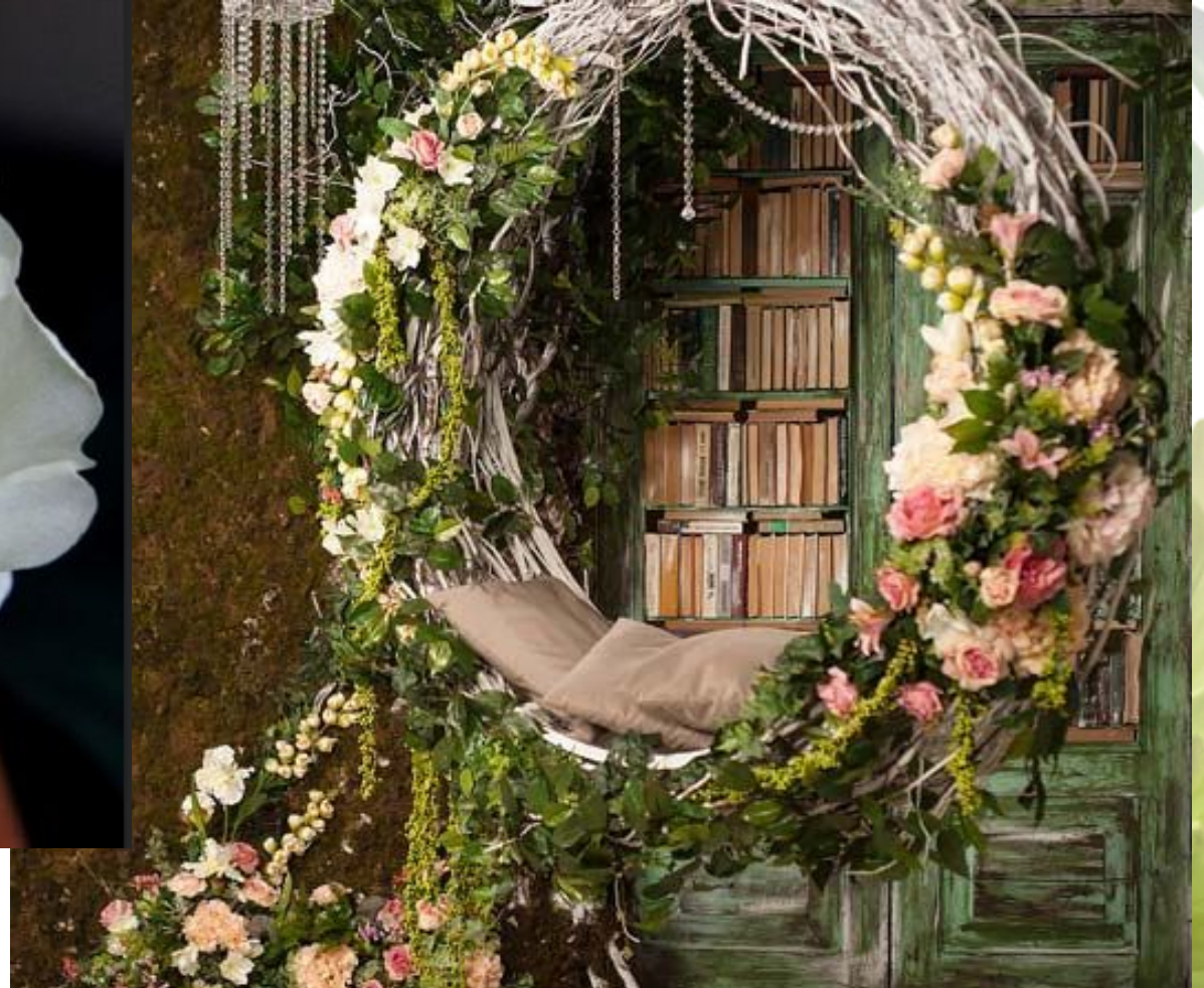
Open Garden Roses